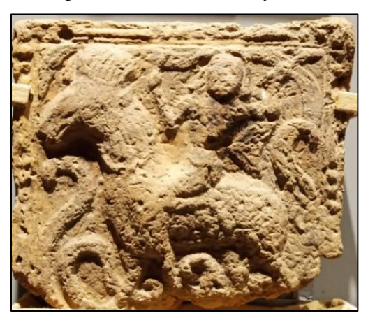
Fig.6 Brick with relief design from Ma Thi Kya stupa.

rider of Sri Ksetra are similar to the design of terracotta plaques of Chansen, Central Thailand. The plaques of Thailand are belonged to the sixth century CE -the eighth century CE.<sup>1</sup>