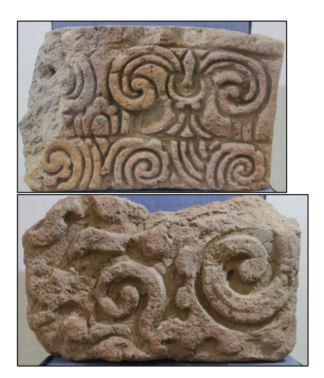
Fig-(7) Decorated terracotta reliefs with scrolling foliate motif.