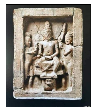
Fig.3 Jataka scene depicted on plaques.

Most of the ancient religious monuments, residential buildings, city walls and town walls were built with bricks. Debris found at an ancient site are the remnants of the ancient structures which stand on the site. To build ancient city state like Sri Ksetra, it is needed millions of bricks. Bricks are different from other archaeological objects in terms of size and weight like coins and beads. Nature of building materials, bricks have to be made near or not far from the construction. Therefore, bricks are locally made material.<sup>1</sup>