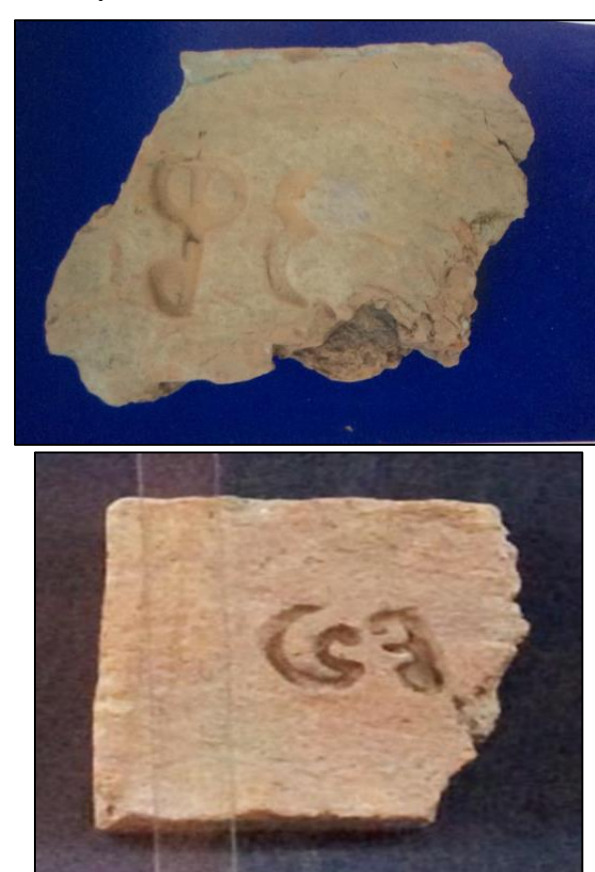
Fig.5 Bricks with Pyu inscriptions

Shwe Phone Pwint Pagoda Museum, Pyay, houses a considerable number of bricks. These bricks were collected from Sri Ksetra. Some of these bricks bear imprinted Pyu numbers and inscriptions. The inscriptions were inscribed in Southern India script. The purpose of these Pyu numbers and inscriptions are difficult to interpret but the numbers might be telling of the number of bricks and the inscriptions might be the sign of brick makers. Such bricks are also found in Beikthano and other Pyu ancient cities.<sup>2</sup>