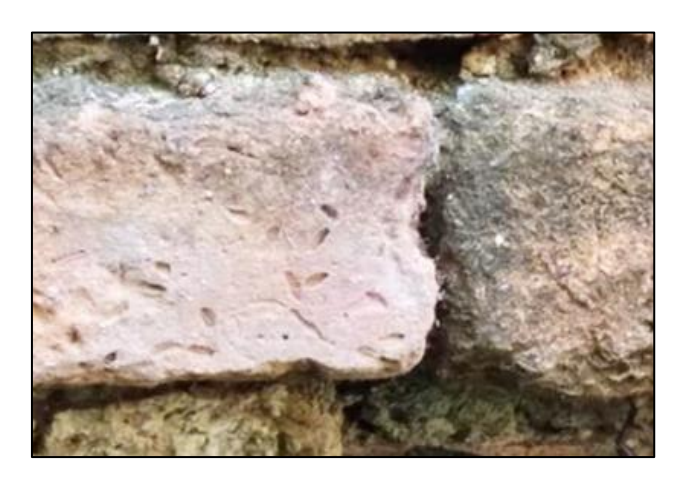
Fig.2 Brick with rice husks from Lulinkyaw gateway.

According to the analysis husk impresses of bricks from Maingmaw, Beikthano, Halin, Sri Ksetra and Wadi reveal that the rice is predominantly rounded grains. In the mid's of 1970 by Kyoto University, tabulated the presence of three types of rice husks embedded in eighty-two samples of old bricks. The types were rounded grains found on early maturing paddy, large grain upland rice, and slender late-maturing paddy.<sup>2</sup>