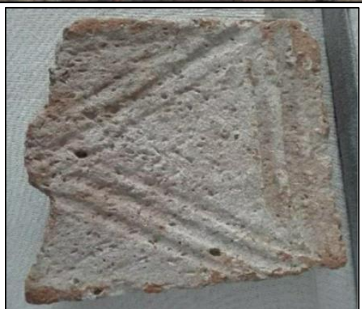
Fig.4 Fingered-marked brick.