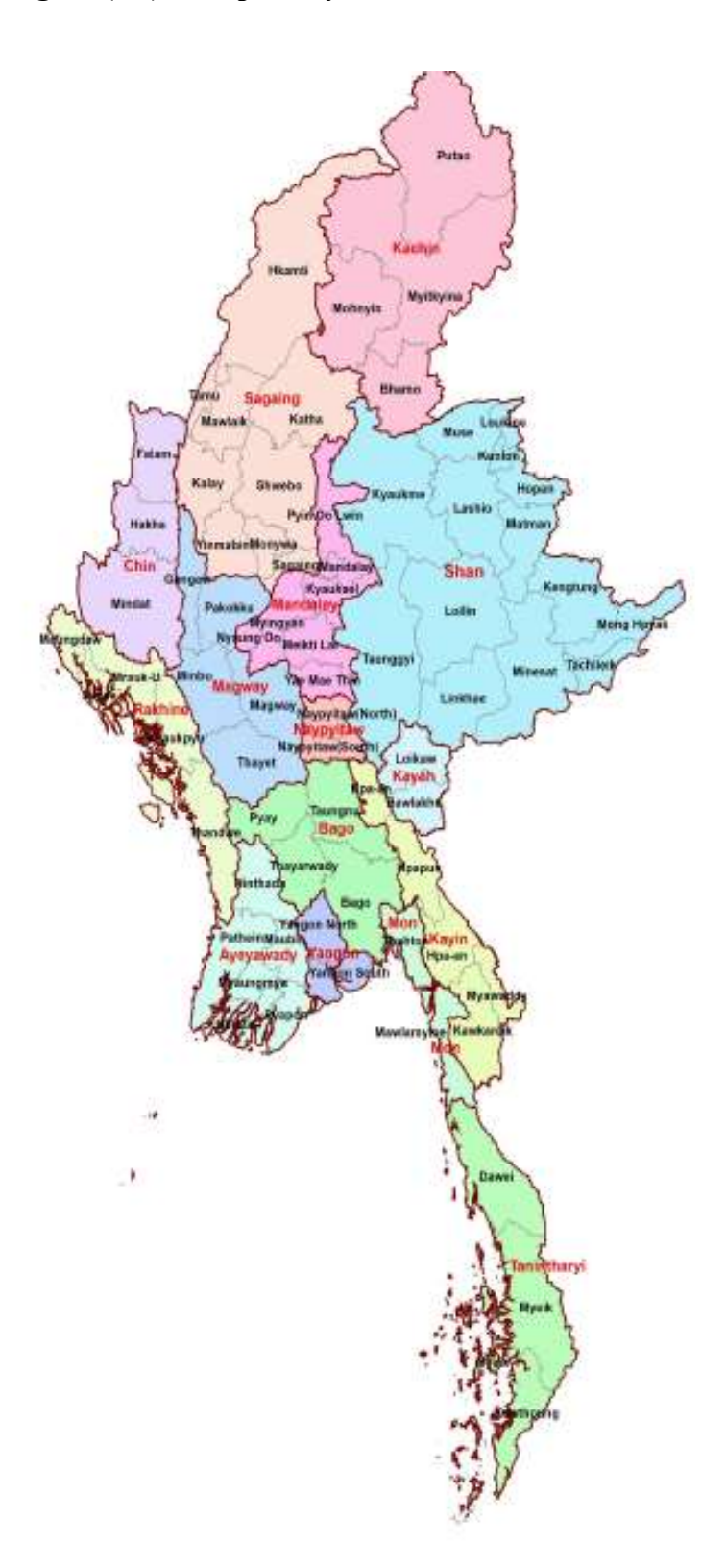
Source: The 2014 Myanmar Population and Housing Census; The Union Report: Census Report Volume 2