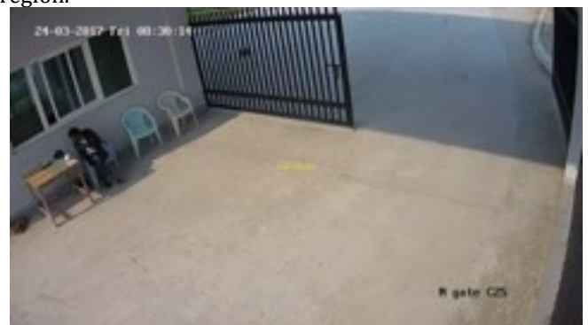
Fig 1 Example Input Image

In the localization part, the entire image is input, and then the time and date region is localized by using block-based DCT (Discrete Cosine Transform). DCT transforms the spatial domain image into the frequency domain one. So, we can localize the time and date region from the DCT image because the numbers or characters on the region usually have high frequency. We detect the time and date region by scanning a window on the DCT image. If the number of horizontal, vertical and diagonal edges in the window is above a threshold value, then we assume that position is the region.