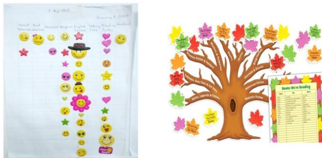
Fig.4. Photographs of Sticker Reward and Reading-tree Activity

Children naturally prefer reward and expect praise from elders to their efforts. Children could gradually upgrade confidence and through the guidance and encouragement of parents and teachers. Reading skill also could be upgraded through rewards and encouragement. Just a tiny sticker or an inch of color paper from their teacher is a great reward for them and could change their learning routine. That tiny reward declared in front of his friends is priceless to them. The more visible the reward is, the more effective it is. The reward should be always in publicly seen. It could not only enhance his learning process but also upgrade his confidence in social life as he has a chance to show his identity in his society. Widely known program for teaching reading is reading tree activity.