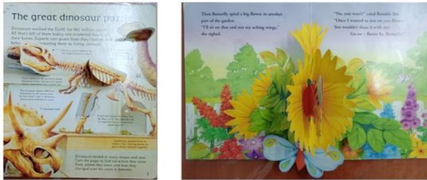
Fig.1. Photographs of the Lift-the-flap book and Pop-up book

Kids are naturally restless and reluctant and could not stand sitting silently all the time. Lift-the-flap book type is appropriate to kids' restless nature. It makes them move and lift the flap all the time, and through their movement and reading text on the flash card convey textual meaning. Besides, it always arouses their curiosities via covered flaps and makes reading go on unconsciously.