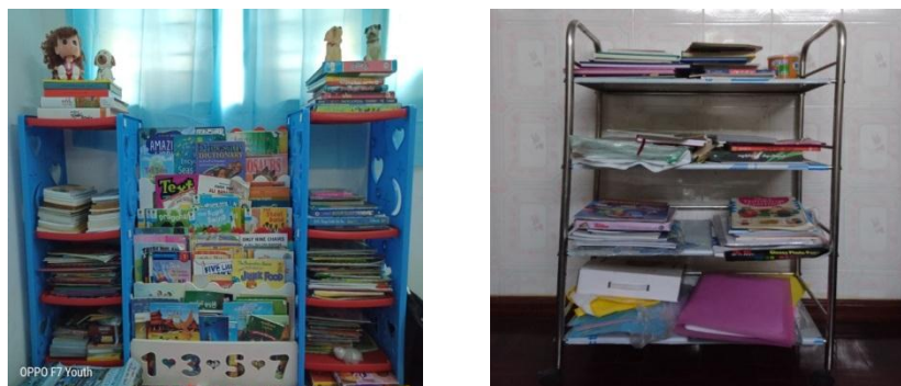
Fig.3. Photographs of kids-bookshelf and ordinary-bookshelf

Whenever we think about something for children, what we should keep in our mind is that their nature and preferences are different from that of the adults. Children's library or bookshelf must be differed in almost everything from public library for adults. Bookshelf designs and the way displaying books on them could change the child reading habits. The library hour for kids and the way dealing with them during and after reading is very important in cultivating reading habit. The colorful front cover of books should be easily visible and reachable to them. Toys and other playing things should be together with them in their reading room as their attention span in reading does not last long by nature. Sometimes, they will do reading and playing simultaneously or alternatively. Let them do whatever they prefer to some extent. Some strict rules and regulations will discourage their reading habits.