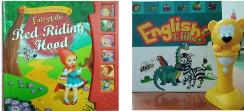
Fig.2. Photographs of Audio Book and Smart Pen