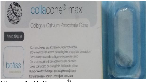
Figure 1. Collacone<sup>®</sup> max

X-ray with parallel technique by drawing two lines (first line connecting the cementoenamel junction (CEJ) of two adjacent teeth on each side, second line drawn from the lowest position on alveolar ridge defect perpendicular to the first one). This perpendicular distance was measured baseline, immediate postoperative at period and 3 months after extraction. To detect the alveolar bone healing, gray scale-relative alveolar bone density (mean gray value of the defect region/ mean gray value of the surrounding bone) was analyzed by using image J software (Geiger et al., 2016). The soft tissue healing was assessed by the Modified Landry and Turnbull healing index, as shown in Table 1. This study was approved by Research and Ethical Committee of University of Dental Medicine, Yangon.