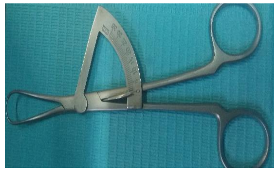
Figure 2. Alveolar ridge mapper