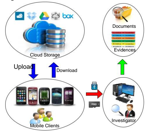
Figure 2. Conceptual Architecture

The proposed conceptual architecture of "Acquiring Cloud Storage Forensic Evidence though Android Smartphone" consists of four components: Cloud Storage, Mobile Clients, Investigator and Generating documents and evidence. The conceptual architecture is shown in Figure 2.