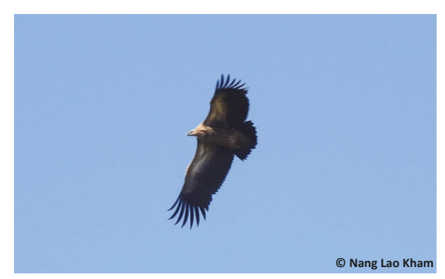
Image 4. A juvenile White-rumped Vulture Gyps bengalensis , in flight around Man Sant Village, Mong Yai Township, Northern Shan State, Myanmar (27 November 2018).

ancient times in China (Leung 2006). Many Myanmar do not have a positive attitude towards vultures, but the local people informed us that they avoided consumption of vultures or their parts, because they are considered disgusting (in taste) and have a putrid odour. Additionally, as in Nepalese communities, many people assume that vultures are a bad omen and bring ruin or bad luck, because vultures are associated with death (Baral & Gautam 2007).