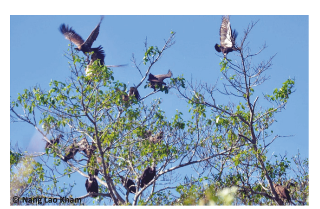
Image 2. A flock of White-rumped Vulture Gyps bengalensis , on the Banyan Tree ( Ficus elastica ) near the carcass.