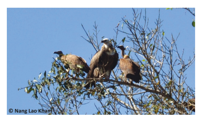
Image 1. Himalayan Vulture Gyps himalayensis and Slender-billed Vulture G. tenuirostris , roost on the Banyan tree nearby the carcass (27 November 2018).