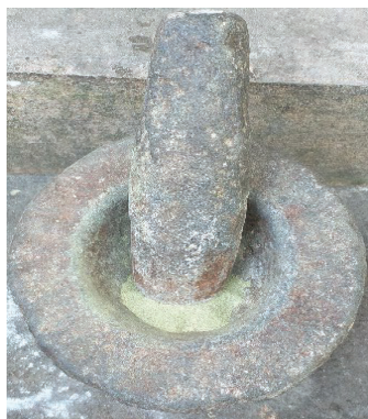
Figure 3. Grinding with agate mortar and pestle (traditional is used)