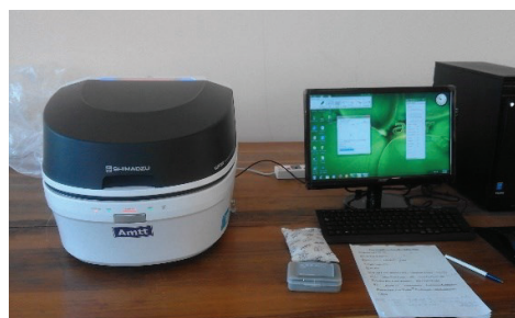
Figure 5. Shimadzu EDX-7000 Spectrometer at Material Science Lab, Taungoo University

Potassium is an important electrolyte (meaning it carries a charge in solution). It helps regulate the heartbeat and is vital for electrical signaling in nerves. Calcium is the most common mineral in the human body — nearly all of it found in bones and teeth. Ironically, calcium's most important role is in bodily functions, such as muscle contraction and protein regulation. In fact, the body will actually pull calcium from bones (causing problems like osteoporosis) if there's not enough of the element in a person's diet.