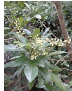
Figure 1. Tha-Na-Kha plant and flower located at Oktwin, Bago Region

Dispersive X-ray Fluorescence technique with fundamental parameter (FP balance) method.