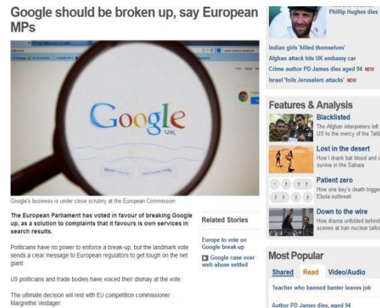
Figure2. Original Web page

We are also able to show a space savings of 70% when the extracted text is compared to the original HTML. Table 1 shows the result of savings.