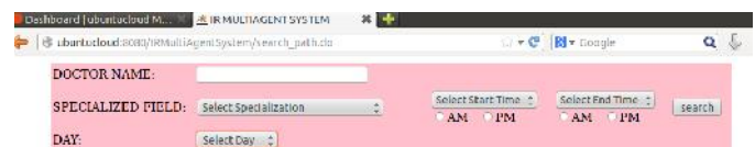
Fig. 2. Information Search Page

We implemented this proposed system based on J2EE and JADE platforms. We used apache tomcat server, axis for web development and MySQL database. The system has run on 6 Intel Core 2 Duo machines and host OS are Ubuntu 12.04 LTS. One machine is for the main Multi-Agent System running environment and others are holding Web Services.