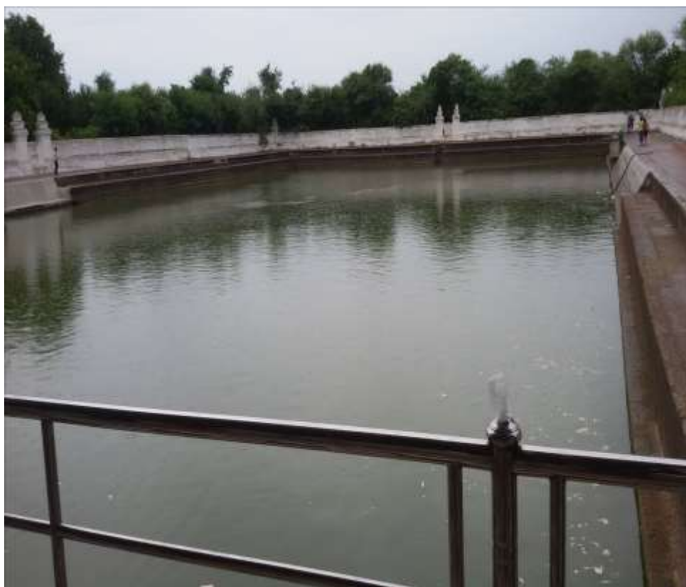
Figure 1. Study area of Kaung-hmu-taw Fishery Pond

Laboratory Observations on algae samples were made by using compound microscope (Olympus) at Department of Botany, Yadanabon University. The size of algae was measured by using micrometer. All species were presented by photomicrographs. The identification and taxonomic description have been based on Desikachary (1959), Prescott (1962) and Skuja (1949), Hoek et al. (1995), Komarek (1985-1989), Dillard (1982-2000), Graham & Wilcox (2000), John et al. (2002).