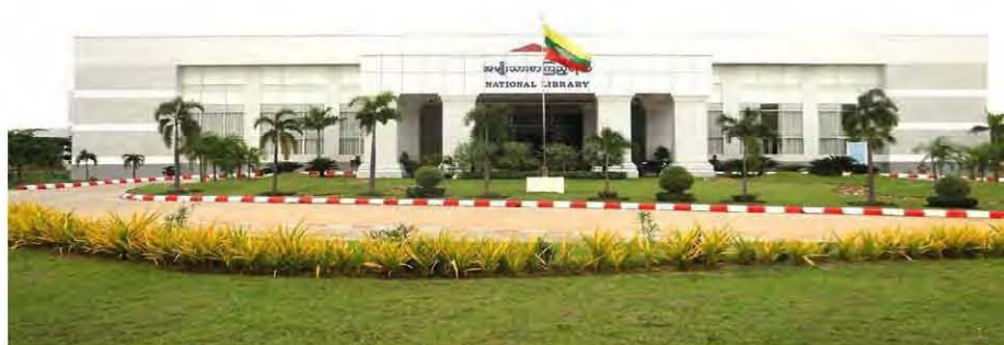
National Library of Myanmar at Capital City, Nay Pyi Taw

The National Library at the capital city of Myanmar, Nay Pyi Taw, was officially opened to the public in 2013. Since then, the mission of the library has changed from “To be the Depository Centre of Myanmar Literary Heritage” to “To be the Depository and Accessible Centre of the Literary Heritage of the Country”. Since that time, she has been trying to collect the traditional manuscripts and making them preserving and conservation as first priority and then making the text accessible to the public.