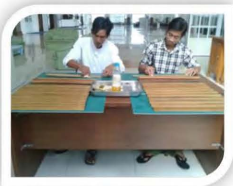
Applying Lemon Glass Oil