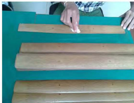
Cleaning with soft cotton