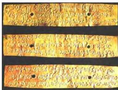
Khin Ba Mound Manuscript found at Thayekhittaya

The earliest manuscript found in Myanmar was in the 5 th Century at Khin Ba Mound, Thayekhittaya. It is one inscribed with excerpts from the Vinaya and Abhidhamma (two of the three parts of the Pali Tipitaka) by PYU scripts on 20 gold leaves, 16.5 cm in length and 4 cm in width. It had two gold covers bound together by a thick gold wire and its ends were fastened to the covers by sealing and small glass beads. Each leaf and cover had two holes through with the gold wire passed. This is stylistically related to two important manuscript types, palm leaf manuscripts and kammavaca.