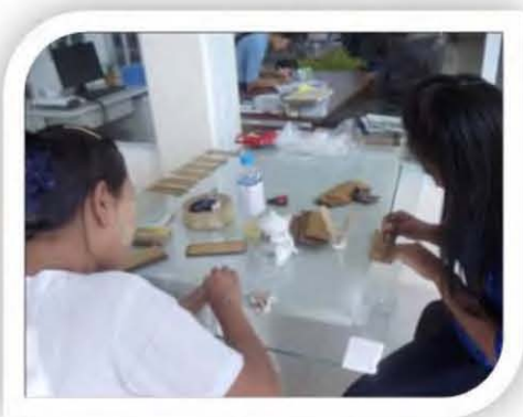
Repairing Damaged Pieces