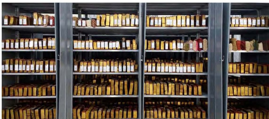
Palm Leaf Manuscripts Storage Area

This unique manuscript collection not only unfold the development of literary and linguistic trends but also record and store early written knowledge of local wisdom related to Buddhism, History and Traditions, Arts, Indigenous Medicine, Astrology, Magic and charms, Laws, Agriculture and Trade etc. The collection is being profoundly used by both foreign and local readers because it provides scholars with primary sources for research and is of great assistance in study of religious, cultural and social profiles of ancient and mediaeval Myanmar.