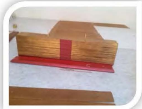
Placing the Bamboo Sticks