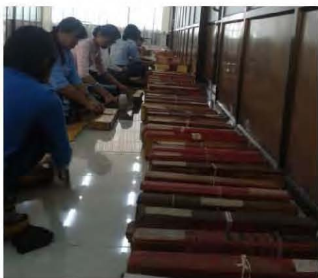
Cleaning the Bundle

It was first established in 1995 as the book binding section in National Library (Now the National Library-Yangon Divisional Library), and it has been as the same section for many years lack of preservation and conservation works. But in 2013, the National Library was officially opened in Nay Pyi Taw, the capital city of the country, for the public. Since that time, the preservation and conservation section has been established with the needs of preservation and conservation of library materials which are slightly damaged by the transporting the collection from Yangon to Nay Pyi Taw. Formerly, paper based materials were emphasized and then extend to palm leaf and parabaik (folded paper) manuscripts.