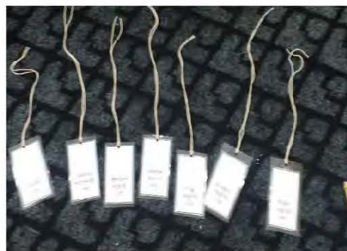
Label with Accession No. and Title