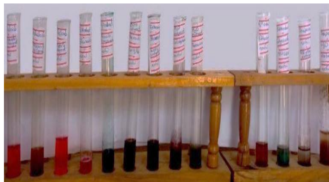
Figure 2 Phytochemical tests of flowers of Bombax ceiba L. (Letpan)